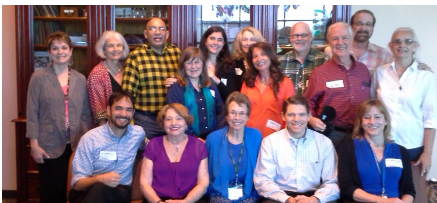
Spring Conference Small Group Co-Leaders

Save the Date: MAGPS Spring Conference April 18-19 2015 St. Elizabeths Hospital, Washington, DC