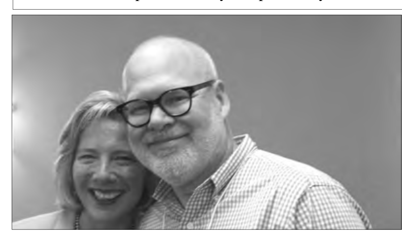
Many more are available on the website at: www.magps.org

Our conference gathering exuded energy and excitement, in sessions and during breaks, as people met, talked, laughed, explored, and discussed the dynamics of favoritism -- both professionally and personally.